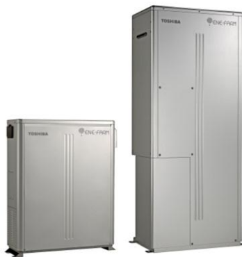
Figure 1 Toshiba and Osaka Gas' Ene-Farm Domestic Fuel Cell

Japan has high expectations for dispersed and high-efficiency power sources, particularly since the terrible Tōhoku Earthquake. Japan already leads the world in the deployment of domestic-scale fuel cells for power and heat through the Ene-Farm products, with over 42,000 units sold and installed in Japan since 2009, establishing a market for installations of fuel cell household energy systems.