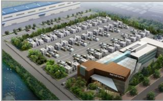
Figure 4 Artists Impression of the finished 58MW power plant at Hwasung, South Korea.

Construction of a 58MW MCFC power plant is underway with operation scheduled to begin by the end of 2013. This is the world's largest fuel cell power plant, and is being built by POSCO Energy in Hwasung, South Korea. The plant will cost about USD 280 million to construct and commission and will provide electricity and heat for 20,000 family homes, with 47% electricity efficiency.