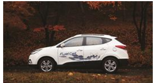
Figure 3 Hyundai's ix35 powered by fuel cells and hydrogen.

The US DOE has launched a public-private partnership to deploy hydrogen infrastructure, H2USA. This focuses on advancing hydrogen infrastructure to benefit transport energy options, including fuel cell electric vehicles.